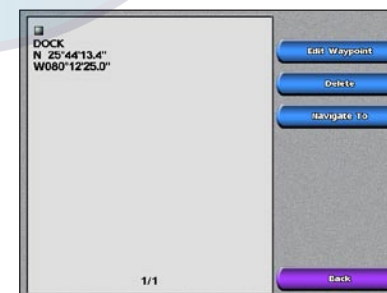
Edit or Delete a Waypoint