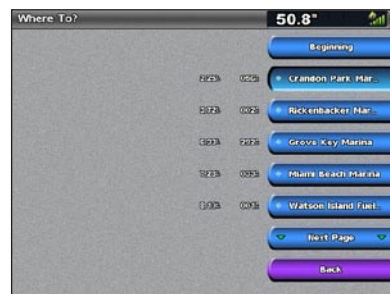
List of Marine Service Items