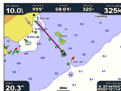
Follow the Route