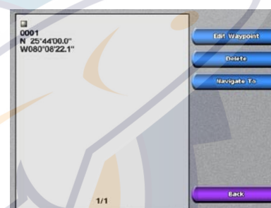
Create Waypoint Screen